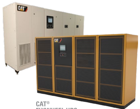
CAT ® FLYWHEEL UPS

Provides continuous power even when power disturbances are likely.