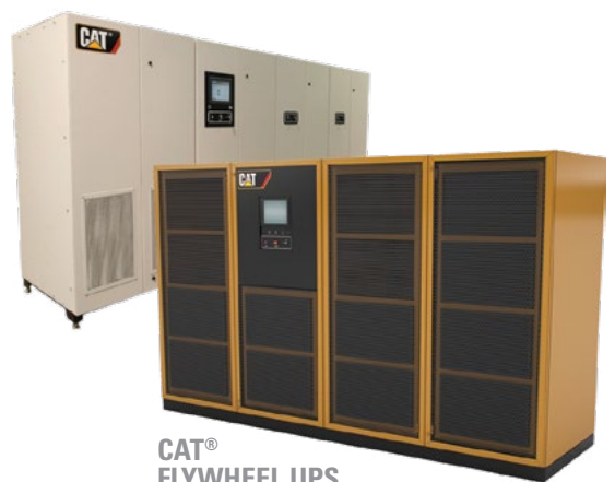
CAT® FLYWHEEL UPS